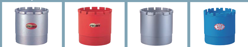
Three separated core bit : Bit, Tube and Coupling.